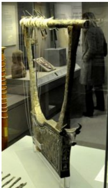
Silver lyre from Royal Cemetery of Ur (in the British Museum).

instruments we know. Alternatively, we may come across a reference to a lute or lyre and not have a sense of what one is, since it is not widely used in our time and context. When we look into the terms (as we will in the remainder of this chapter), we discover how much even familiar instruments have evolved and how different ancient ones seem to have been. We are made aware of the limits of our individual knowledge as a guide to interpreting the text as well as some instances when even our collective human efforts to investigate leave us uncertain. We are also alerted to aspects of the