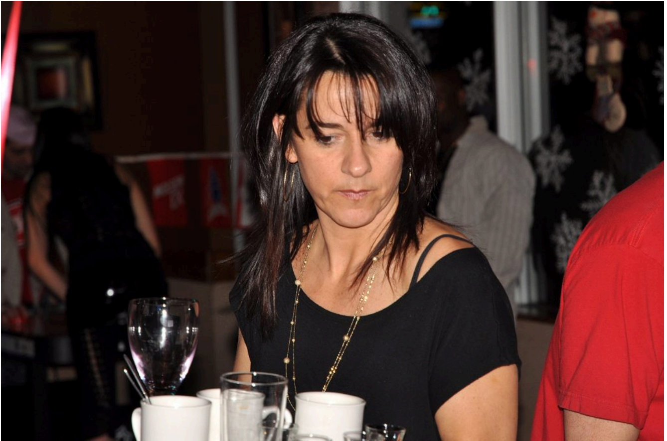
Figure 5.2: Restaurant worker