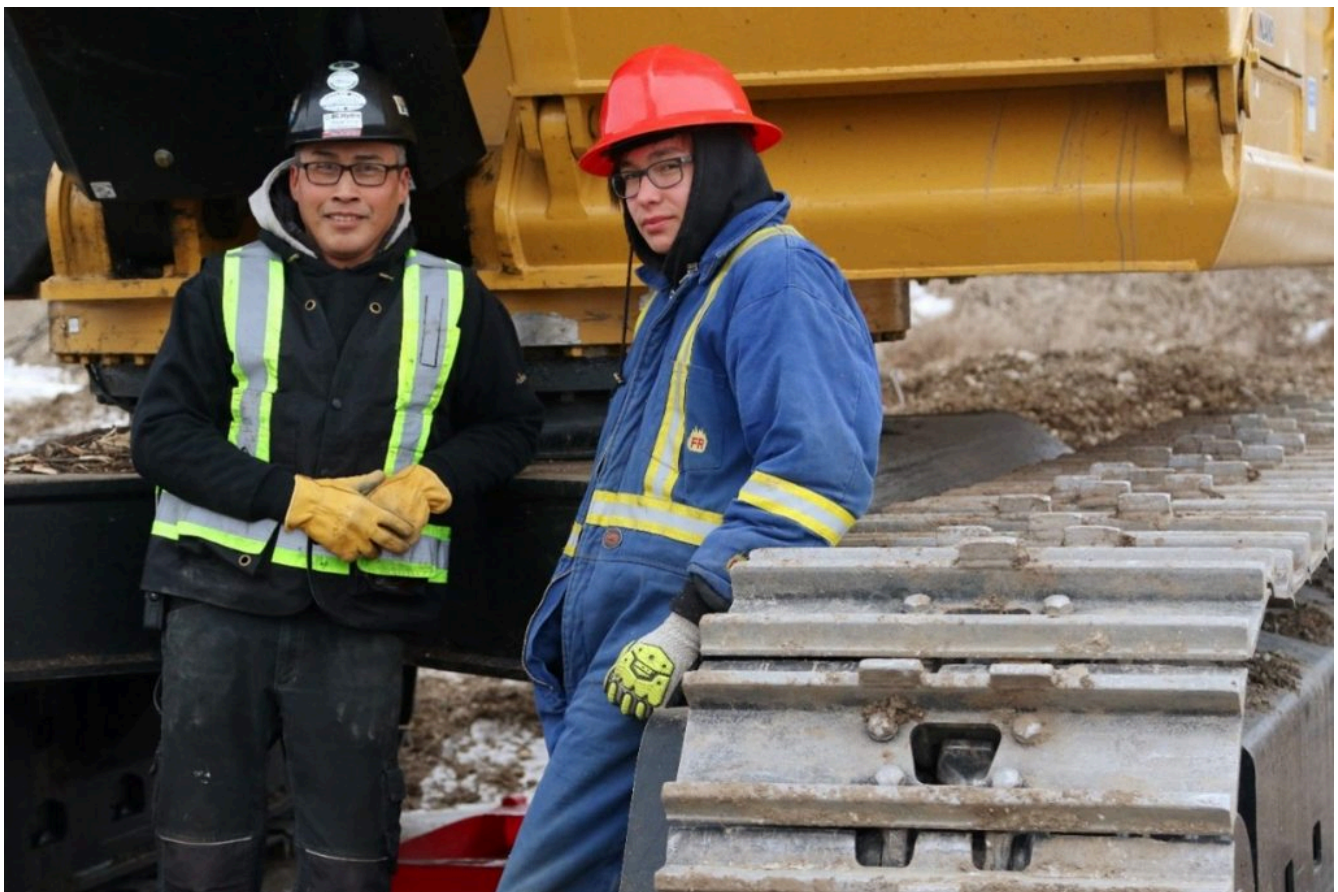
Figure 2.3: From McLeod Lake Indian Band, Indigenous employees of Duz Cho Construction in northeast B.C. work on tree clearing in the Peace River district.