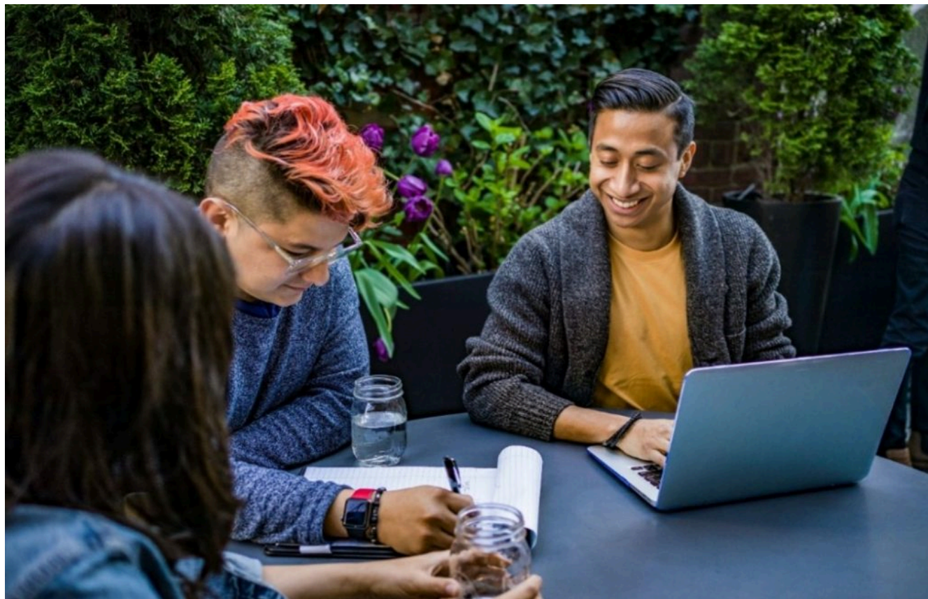
Figure 1.2: A meeting of a diverse group of workers (Jopwell, n.d.)