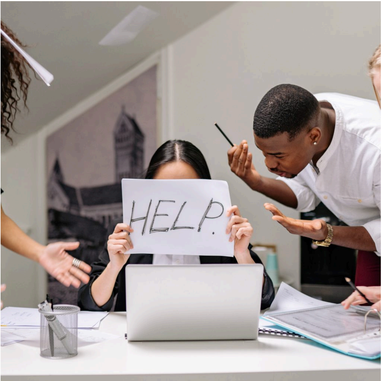
Figure 4.4: Office worker criticised holding up a HELP sign