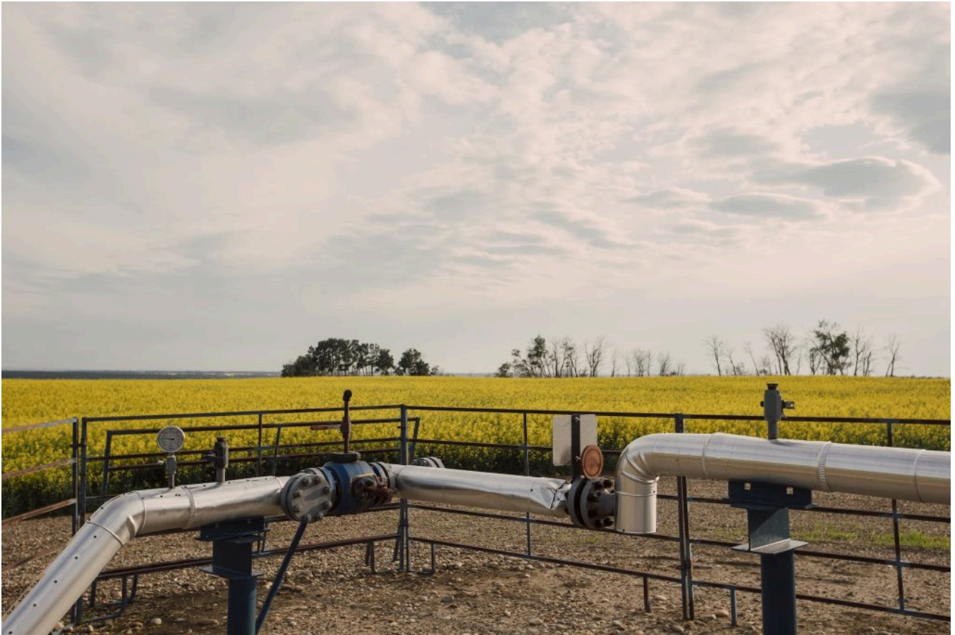
Figure 3.2: Gas compression station