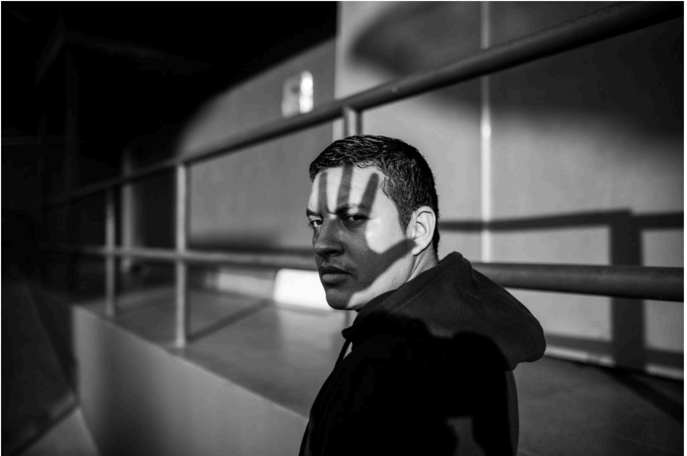
Figure 2: A sad Latin American man pushed away