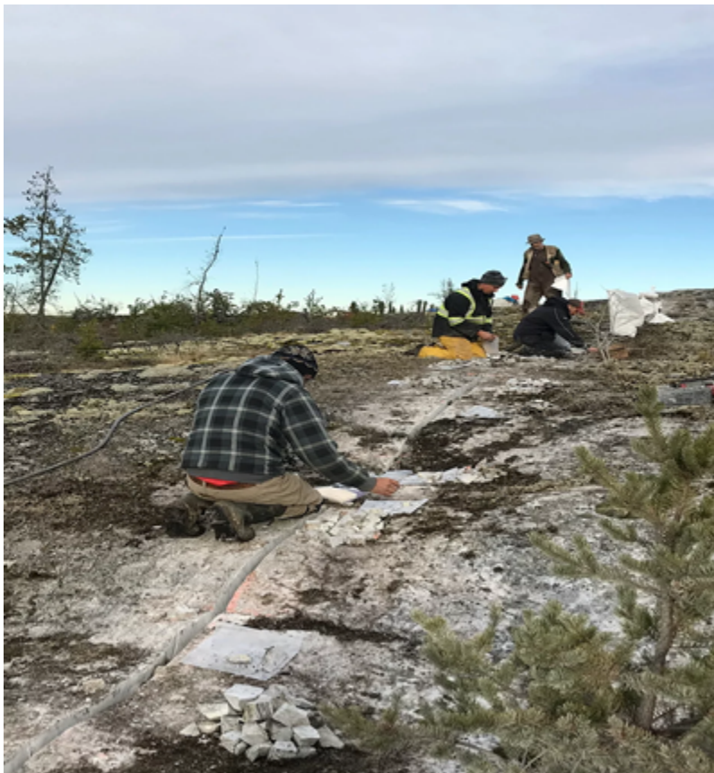
Figure 1.6: A depiction of sampling for lithium for future mining.

SilverRocks is a lithium mining company with head offices in downtown Vancouver and is trading on the Toronto Stock Exchange. SilverRocks' lithium resource is located in the brine beneath the surface of depleted oil reservoirs in Northern Alberta, though it is also developing open pit mines in eastern British Columbia and investigating geothermal energy sources of lithium. Lithium is used in batteries and in metal production and has many other lucrative applications. The fledging electric car industry holds great promise for companies such as SilverRocks.