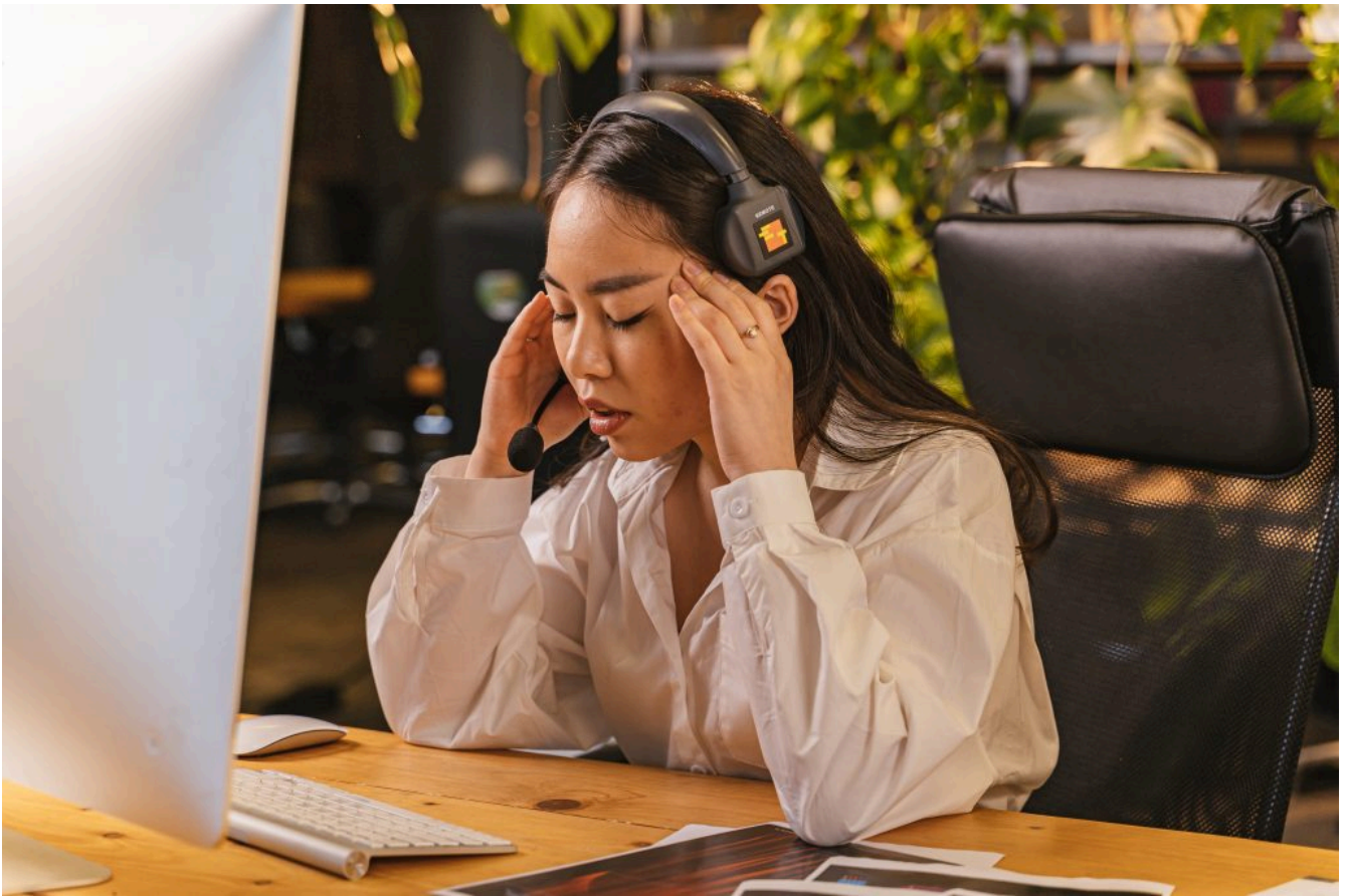
Figure 4.2: Woman with migraine struggling at work