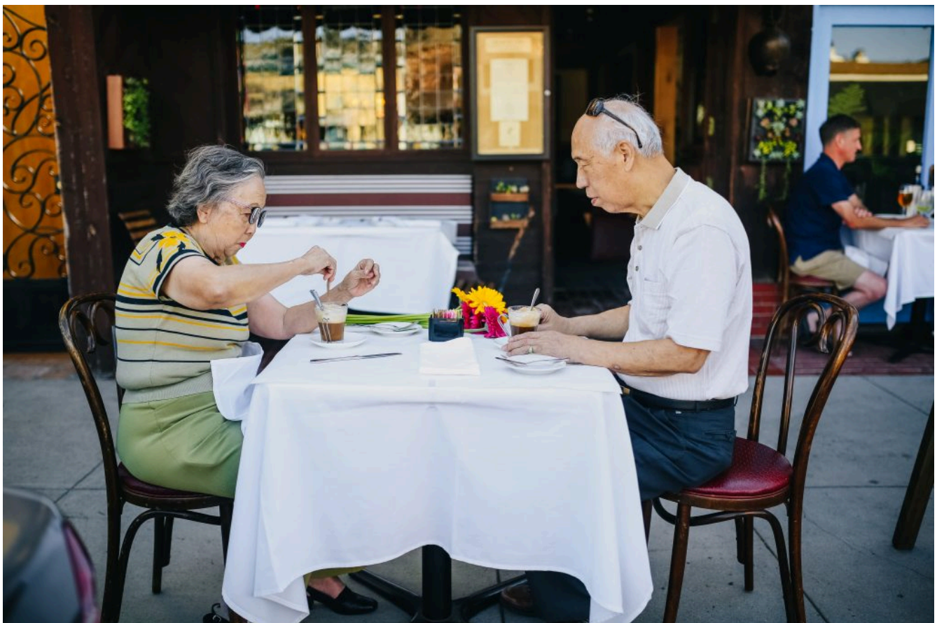
Figure 5.1: Senior Couple on a date

While many workplaces are stressful, restaurants are considered particularly difficult, stressful places to work. Restaurant workers often experience anxiety, tension, sleep deprivation, overwork, competitiveness, verbal abuse and a chaotic environment. Not all restaurant businesses last, leading to workers to feel vulnerable and worried that the business will close and they will lose their jobs. Staff also often work long hours with inconsistent pay and schedules. Dealing with customers and relying on tips for a significant portion of one's income is "precarious" work that is associated with stress and depression (Curley, 2018). In fact, people in the restaurant industry contend that a severe mental health crisis is happening behind the scenes and that it is not discussed enough (Akhtar, 2016). As a response to this situation, some websites and support groups for restaurant workers have been created to improve restaurant work culture (FairKitchens, n.d.).