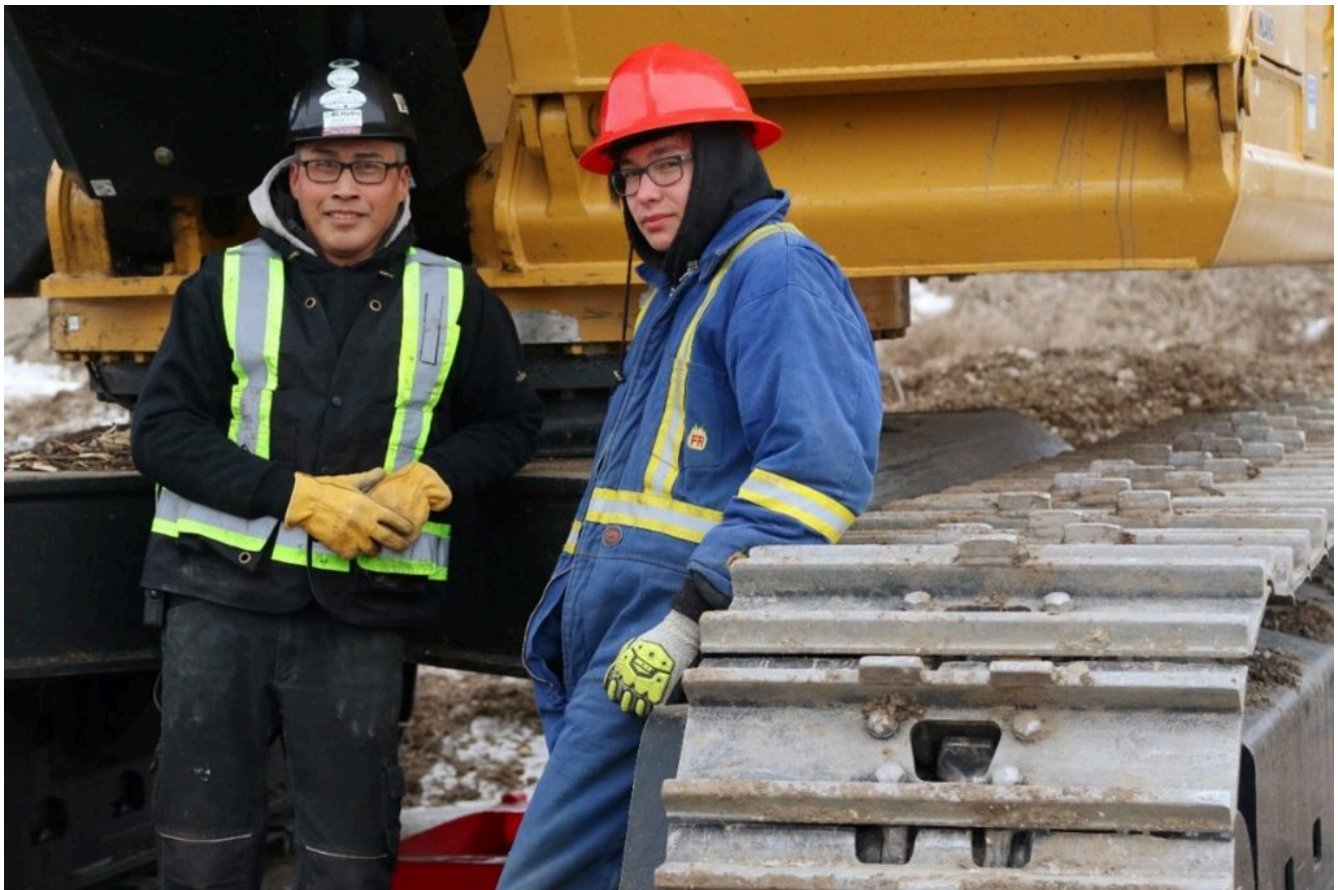
Figure 1.3: From McLeod Lake Indian Band, Indigenous employees of Duz Cho Construction in northeast B.C. work on tree clearing in the Peace River district.