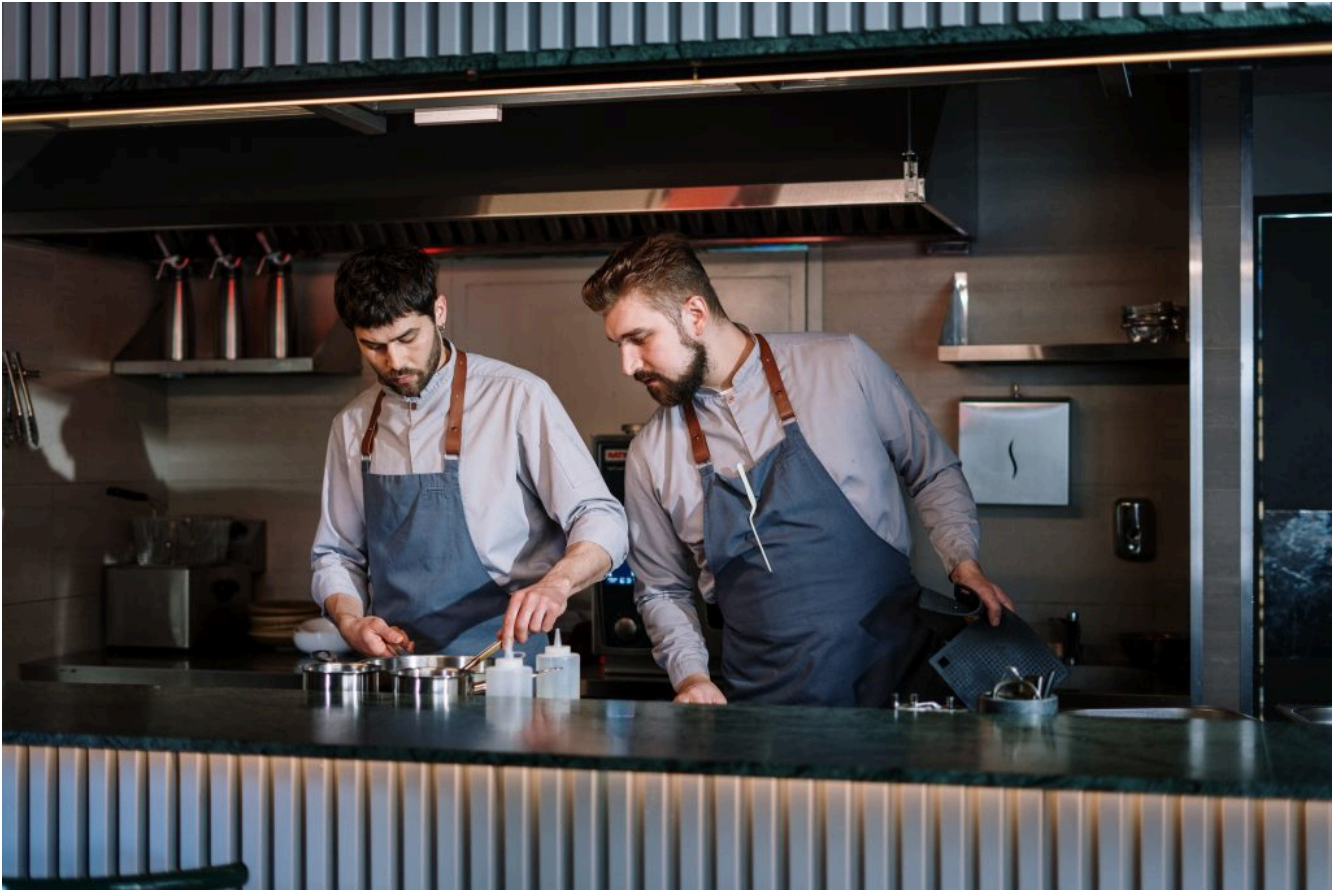
Figure 5.3: Restaurant food preparation