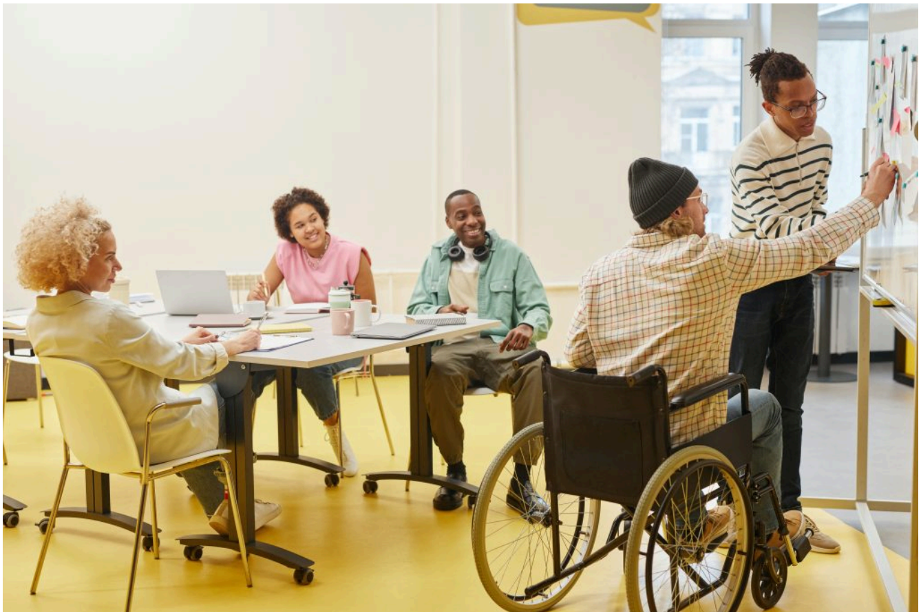
Figure 4.1: Workplace meeting including visibly disabled worker

Employers are being encouraged to treat their diverse groups of employees equitably and continuously support them (Leonard, 2022). Employers in Canada also have a legal duty to keep employees safe, not discriminate and take steps to avoid any negative effects on an employee based on personal characteristics such as gender or disability (British Columbia Human Rights Tribunal, n.d.; Government of Canada, 2022; WorkBC, 2022). Still, even with such laws and organizational policies in place, people with disabilities sometimes experience ignorant comments or prejudiced behaviour from others at work.