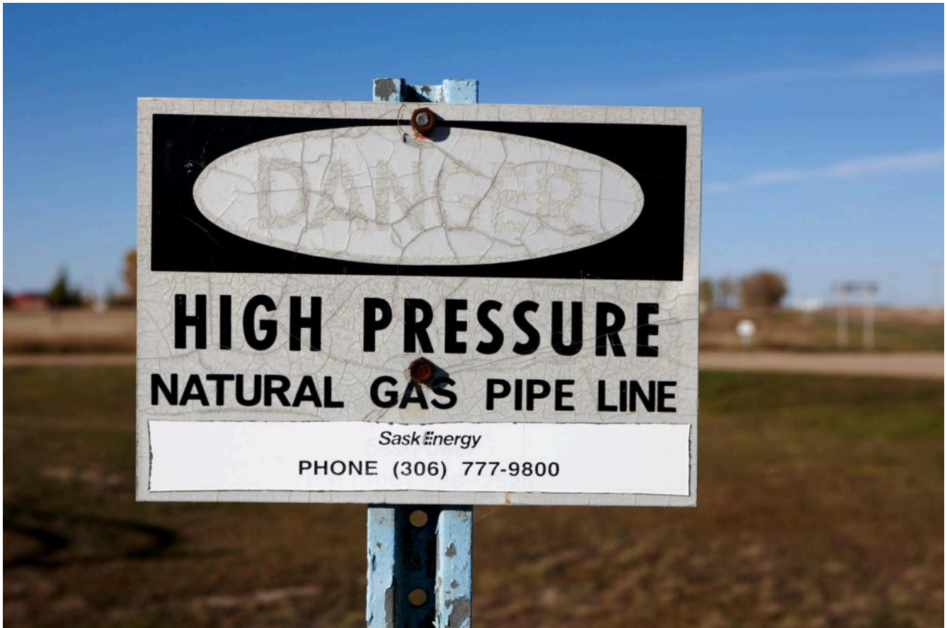
Figure 3.3 Danger sign for an underground high-pressure natural gas pipeline: Bengough, Saskatchewan, Canada