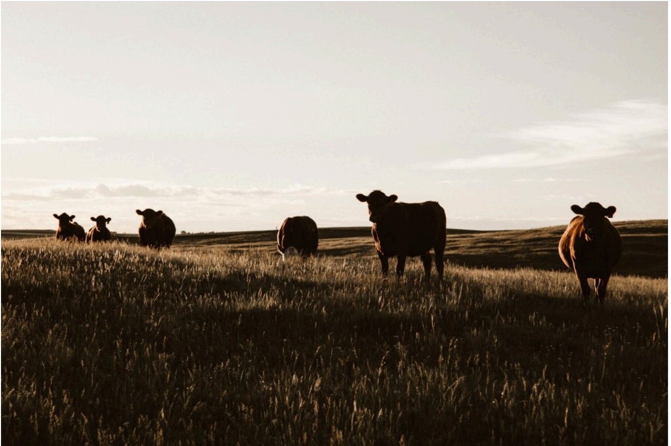
Figure 3.1: Cattle ranch